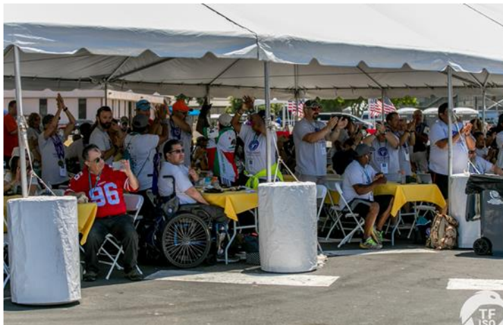
The Valor Games Far West veteran athletes celebrate a great games at the closing ceremonies.

To view more pictures from the 2018 Valor Games Far West go to: https://taskforceiso.client.photos/gallery/valor-games-far-west-18